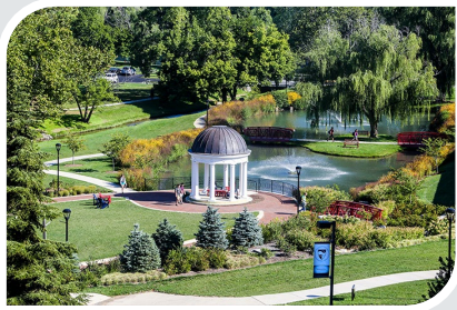
Winchester Main Campus 1460 University Drive Winchester, VA 22601