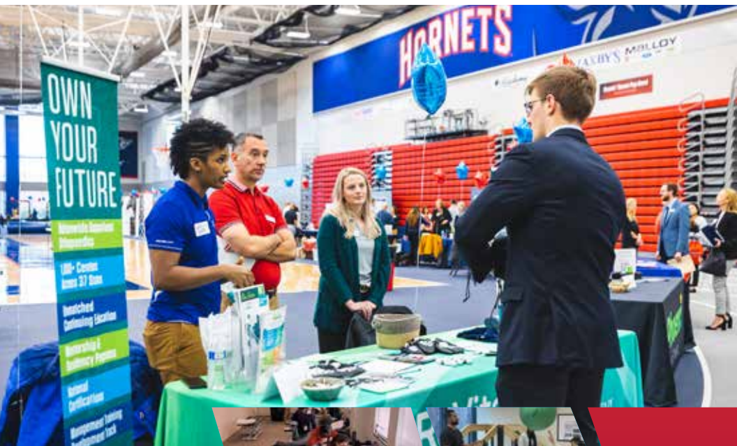
Above: Annual PT Job Fair