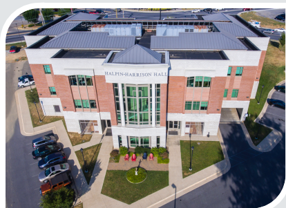
Halpin-Harrison Hall 1460 University Dr. Winchester, VA 22601