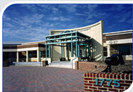
Health Professions Building, located on the Winchester Medical Center Campus