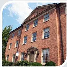
James L. Bowman Building 20 South Cameron Street Winchester, Virginia 22601