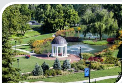
Winchester Main Campus 1460 University Drive Winchester, VA 22601