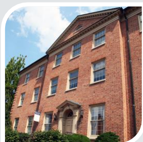
James L. Bowman Building 20 South Cameron Street Winchester, Virginia 22601