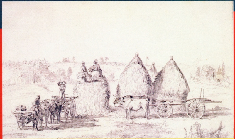
Scenes like the one depicted in this sketch of enslaved people near Culpeper, Virginia, about sixty-five miles from here, harvesting wheat, would have been a common sight at the Retreat during harvest time.

Enslaved people, like those who labored here at the Retreat, worked "from can to can't"—meaning they worked from the early morning light until it became so dim they could no longer see. For over sixty years before the Civil War began, dozens of enslaved people toiled in the fields in front of you, planting, caring for, and harvesting either wheat or corn, two of the Shenandoah Valley's main crops. During the summer, enslaved people laboring in the fields worked, on average, fourteen hours per day. During harvest season, the workday sometimes lasted a few hours longer.