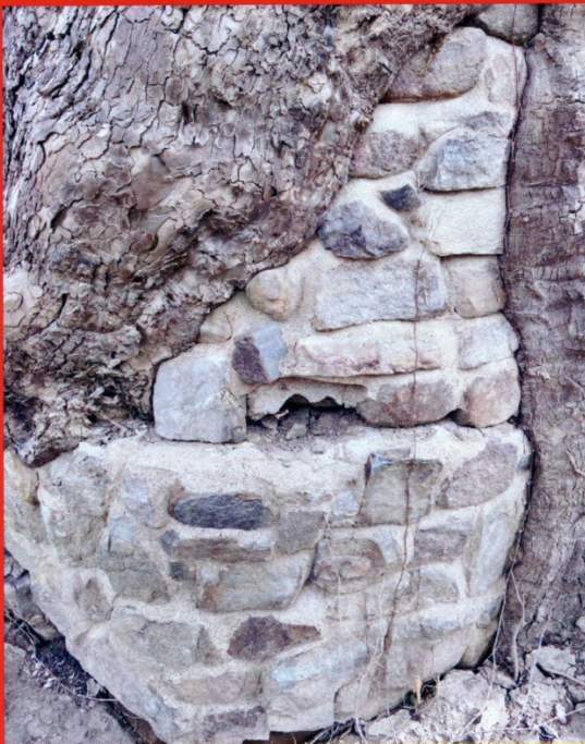
Conditions are not always safe to view the west side of the tree. This photograph shows the tree's entrance.

It is undeniable, as the last stop on this tour will reveal, that freedom seekers set foot on this property during their northward journey. But what attracted them to the Retreat? Oral tradition notes that freedom seekers who used the Shenandoah River to reach Harpers Ferry, an important stop on the Underground Railroad located approximately fifteen miles from here by water, hid in a hollow sycamore tree on this property situated along the banks of the Shenandoah River. It is believed that the massive sycamore tree in front of you is that tree. The tree is hollow, with the entrance on its west side, facing the river. At some point in the tree's life, the entrance was covered with stone. Scientific testing conducted on the tree in the summer of 2025 revealed that it is nearly 420 years old and would have been large enough to serve as a hideout for freedom seekers in the decades prior to the Civil War.