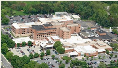
WellSpan Chambersburg Hospital 112 North Seventh Street Chambersburg, PA 17201