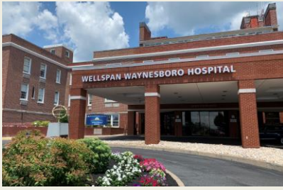
WellSpan Waynesboro Hospital 501 East Main Street Waynesboro, PA 17268